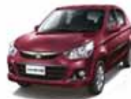
Fire Brick Red